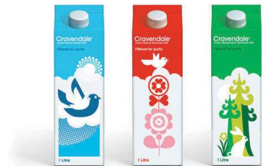
Image wraps around the carton

How will it look like with many in a display case at a store